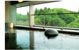
露天風呂(東館7F) Open-air Bath (East Building 7F)