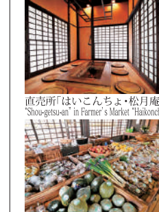
直売所「はいこんちよ」 Farmer's Market "Haikoncho"