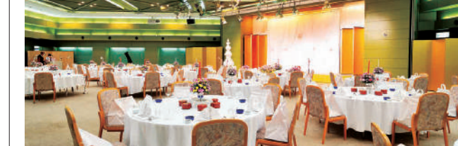
中会議室(本館4F) Medium Meeting Room (Main Building 4F)