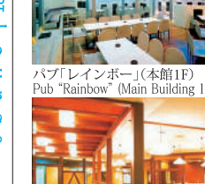
パブ「レインボー」(本館1F) Pub "Rainbow" (Main Building 1F)