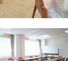
大会議室(本館4F) Large Meeting Room (Main Building 4F)