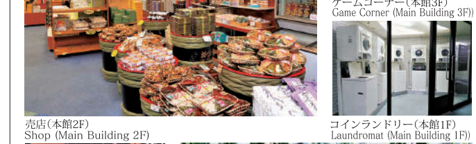
売店(本館2F) Shop (Main Building 2F)