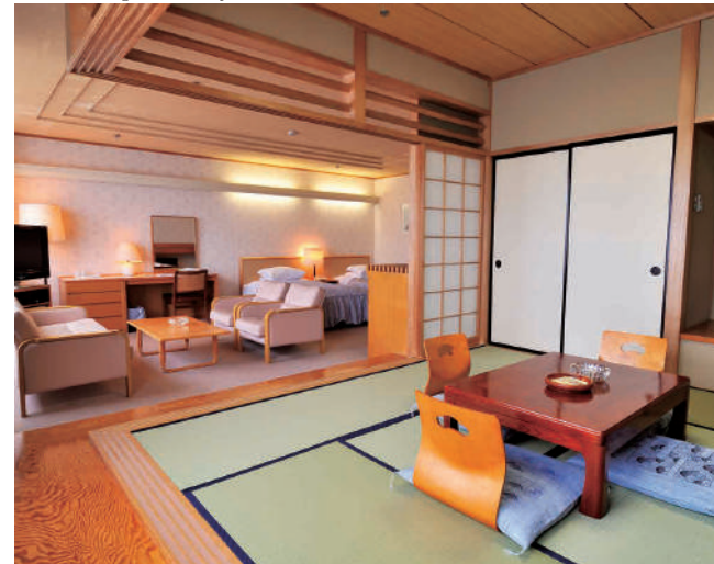
和洋室(本館) Japanese-Western Dual Style Room (Main Building)