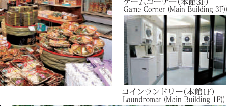
コインランドリー(本館1F) Laundromat (Main Building 1F)