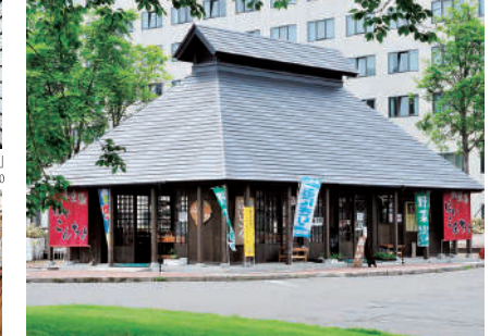
直売所「はいこんちよ」 Farmer's Market "Haikoncho"

爽やかな緑の風が吹き抜けるロケーションでウェディングも人気です。結婚式・披露宴から各種宴会、会議、研修会など用途に応じて様々なご利用いただけます。