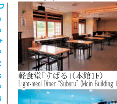
軽食店「すばる」(本館1F) Light-meal Diner "Subaru" (Main Building 1F)