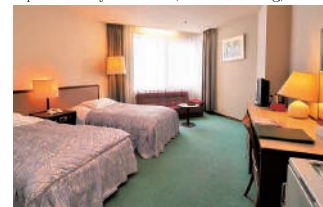
洋室(本館) Western Style Room (Main Building)