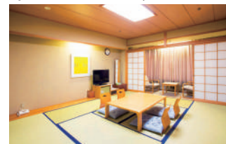
和室(本館) Japanese Style Room (Main Building)