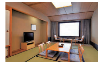
和室(東館) Japanese Style Room (East Building)