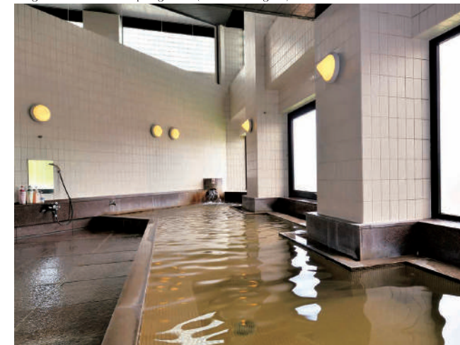
大浴場(本館3F) Indoor Bath (Main Building 3F)

旬の味わい、津南ならではの食材を堪能していただくレストランで、料理長が職を振るう料理をお楽しみください。各種お土産品を取り揃えた売店やゲームコーナー、ランドリーコーナーなど館内でも快適にお過ごしいただける設備が充実しています。