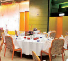
研修室(本館4F) Small Meeting Room (Main Building 4F)