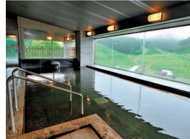
展望温泉大浴場(東館7F) Large Panoramic Hot Spring Bath (East Building 7F)