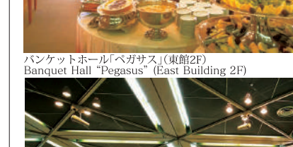
多目的ホール「オーロラ」(本館6F) Multi-purpose "Aurora" (Main Building 6F)