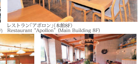
カフェテリア「ポールスター」(本館2F) Cafeteria "Pole Star" (Main Building 2F)