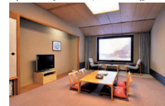
ペットと宿泊可能和室(東館) Pet-Compatible Japanese Style Room (East Building)