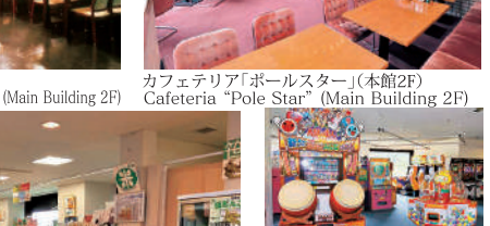
ゲームコーナー(本館3F) Game Corner (Main Building 3F)