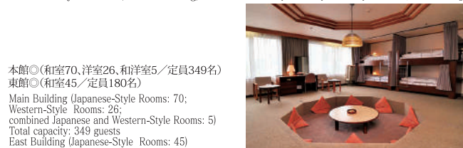
GBルーム(本館) Group Bedroom (Main Building)

本館○(和室70、洋室26、和洋室5/定員349名) 東館○(和室45/定員180名) Main Building (Japanese-Style Rooms: 70; Western-Style Rooms: 26; combined Japanese and Western-Style Rooms: 5) Total capacity: 349 guests East Building (Japanese-Style Rooms: 45) Total capacity: 180 guests